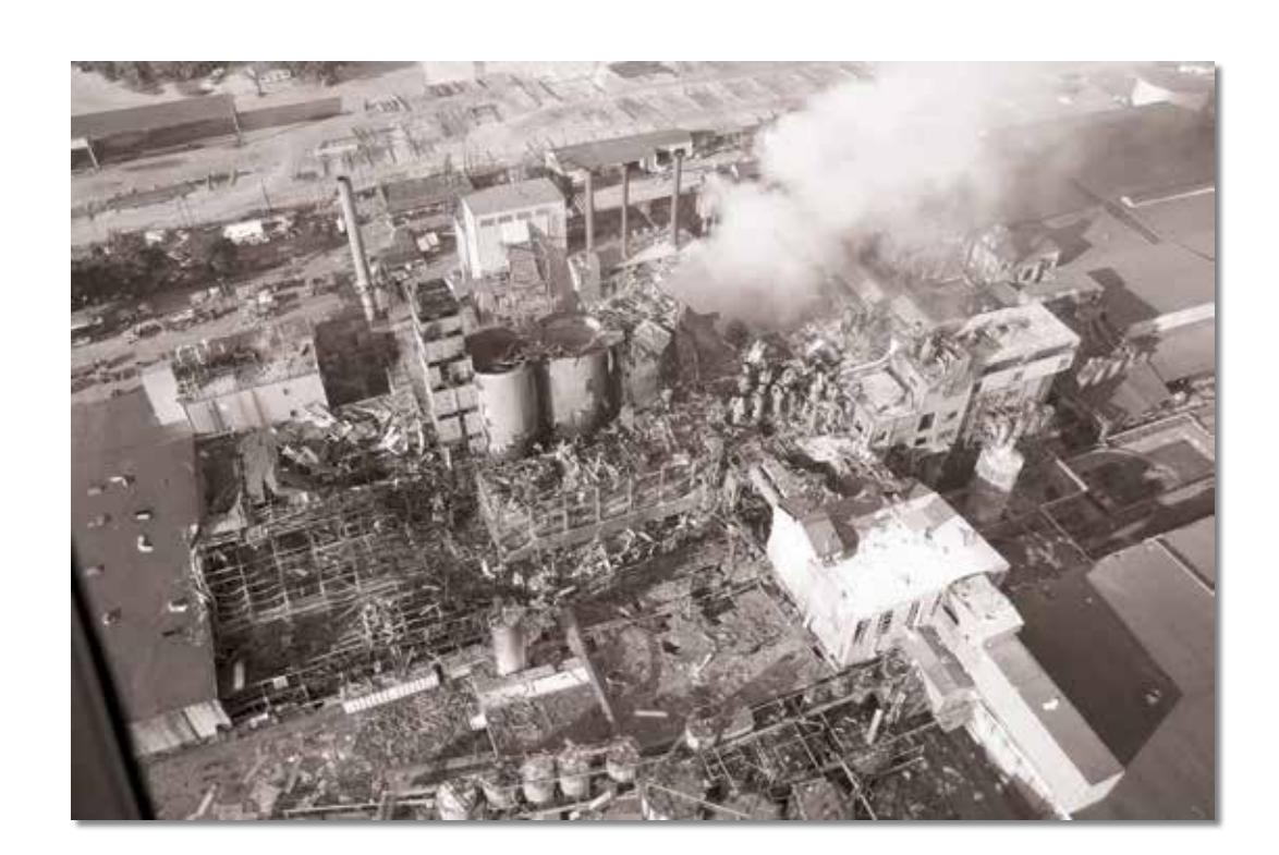
Fig. 1: The Bhopal plant during the accident

It is estimated that a total of 30 metric tons of MIC gas was emitted over a period of 45 - 60 minutes before the process could be shut When you introduce a figure, diagram, table etc. into a report, it is always necessary to introduce it at an appropriate point in down (see Figure 1). Because the gas cloud was composed of materials denser than the air, it stayed close to the ground and spread into the neighbouring Bhopal community (Eckerman, 2005). It is reported that people of smaller stature – especially children – were the worst the text. affected by the disaster. The main cause of death was choking, with the death toll estimated at 2000 by some (Rice, 2006), and as high as 8,000 by others (Eckerman 2006). The affected area, spanning a radius of 15 kilometres, is shown in Figure 2.