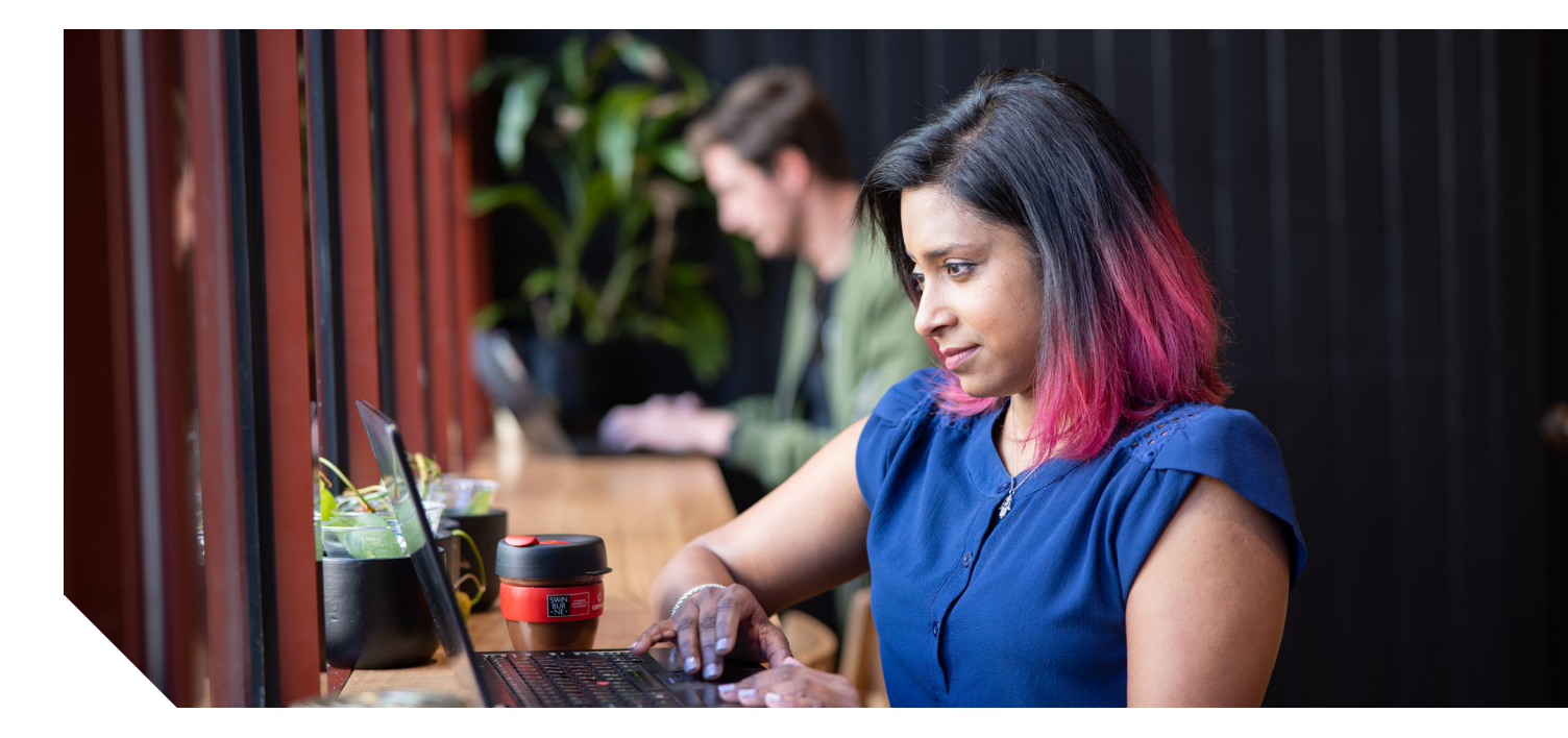
Future Capabilities Needs